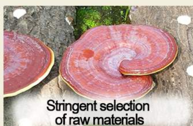
Stringent selection of raw materials