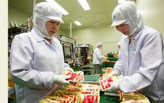
Strict quality inspection