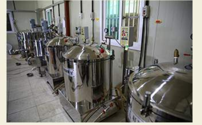
Red Ginseng extraction