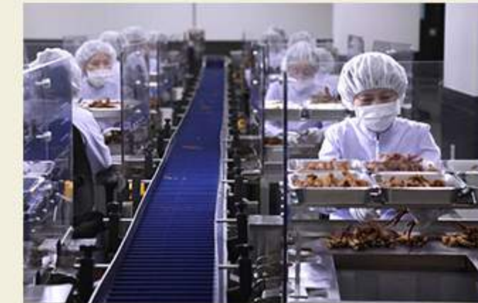
Stringent selection of raw materials