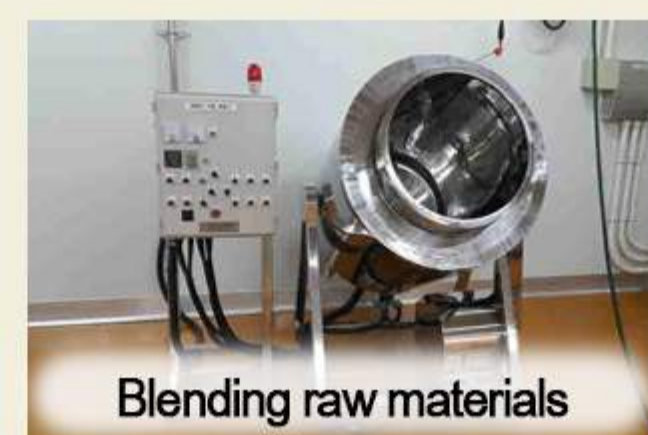
Blending raw materials