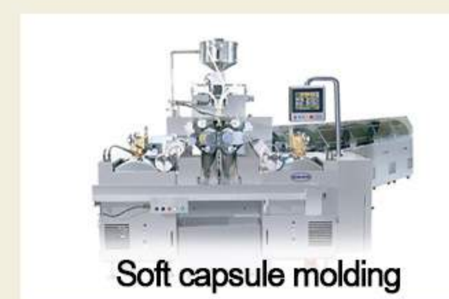
Soft capsule molding