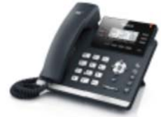
Yealink T4 series