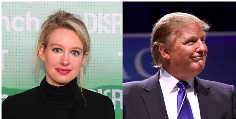
Elizabeth Holmes and Donald J. Trump