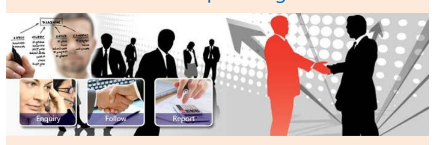
CRM- for Management of Customer, Task, Work Management, Enquiry , follow up , quotation , Final Enquiry and close Enquiry. Tracking of all Leads...