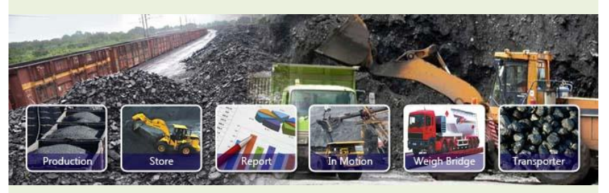
Coal Plant Workflow Management System, for managing Sales, Purchase, Mines with Weigh Bridge data online...