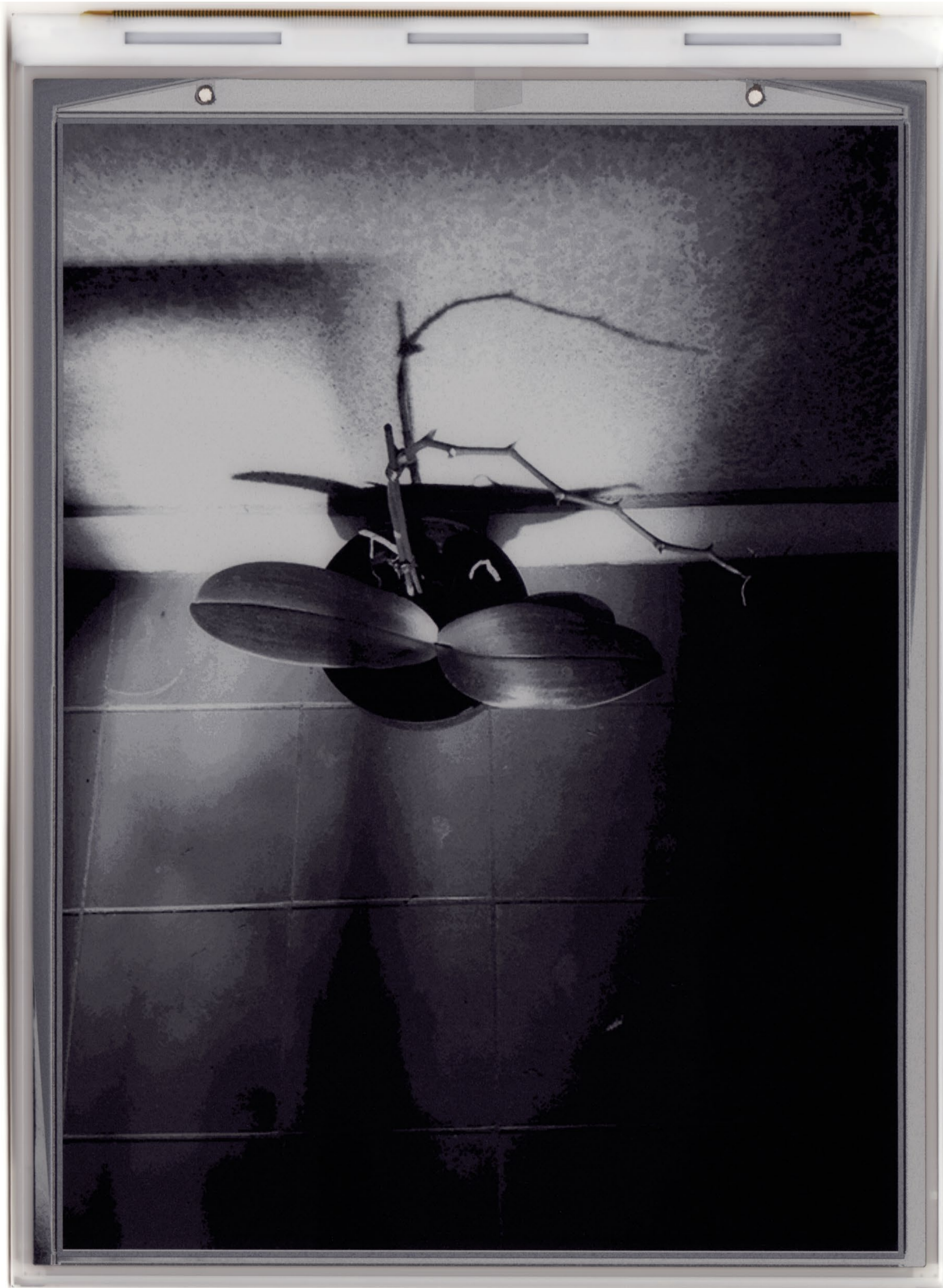
Urtype # 7

electronic ink on e-paper display - 102 mm x 139 mm - © urfaut - Edition of 6 plus 2AP - 2013