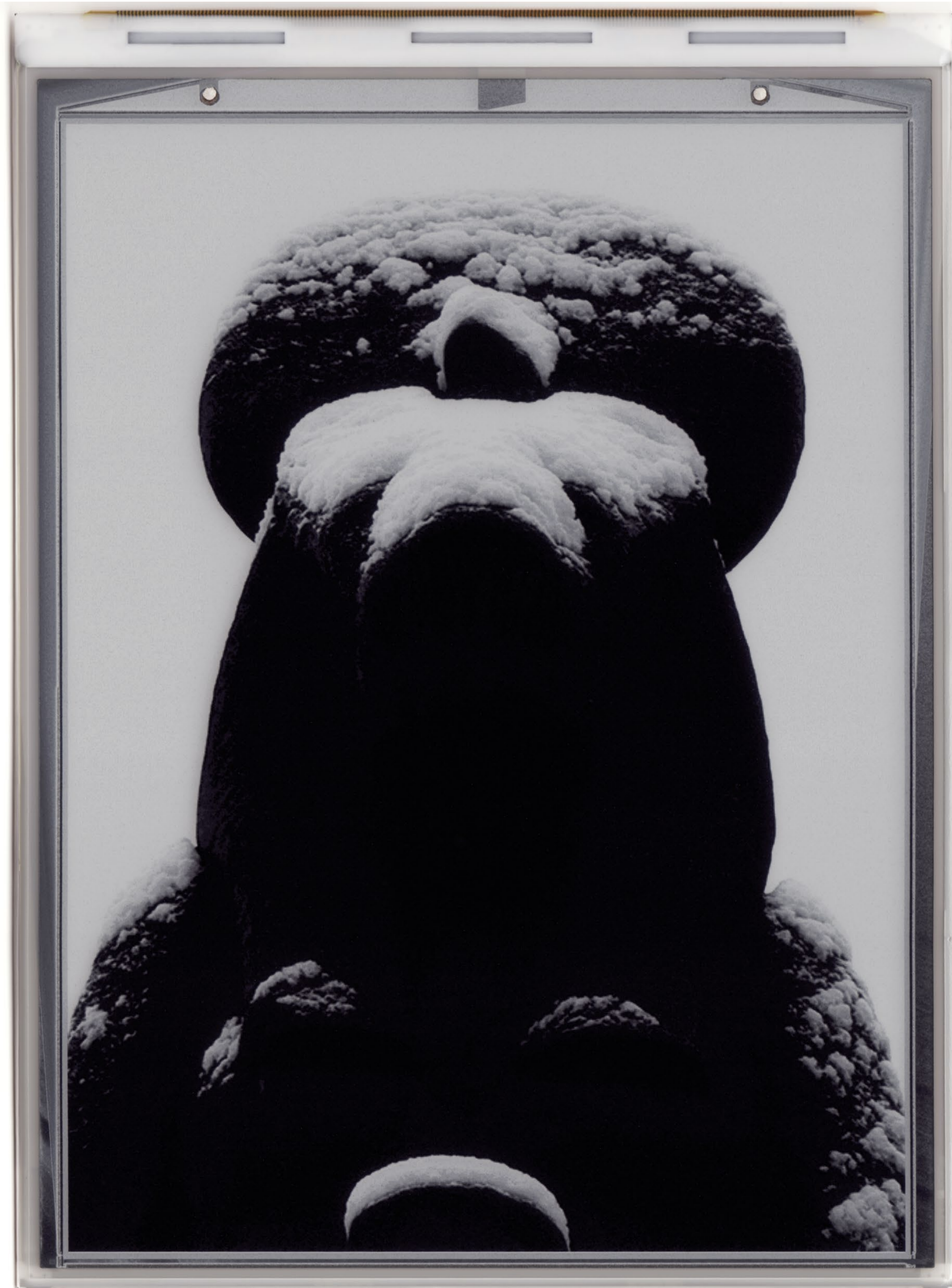
Urtype # 2

electronic ink on e-paper display - 102 mm x 139 mm - © urfaut - Edition of 6 plus 2AP - 2013