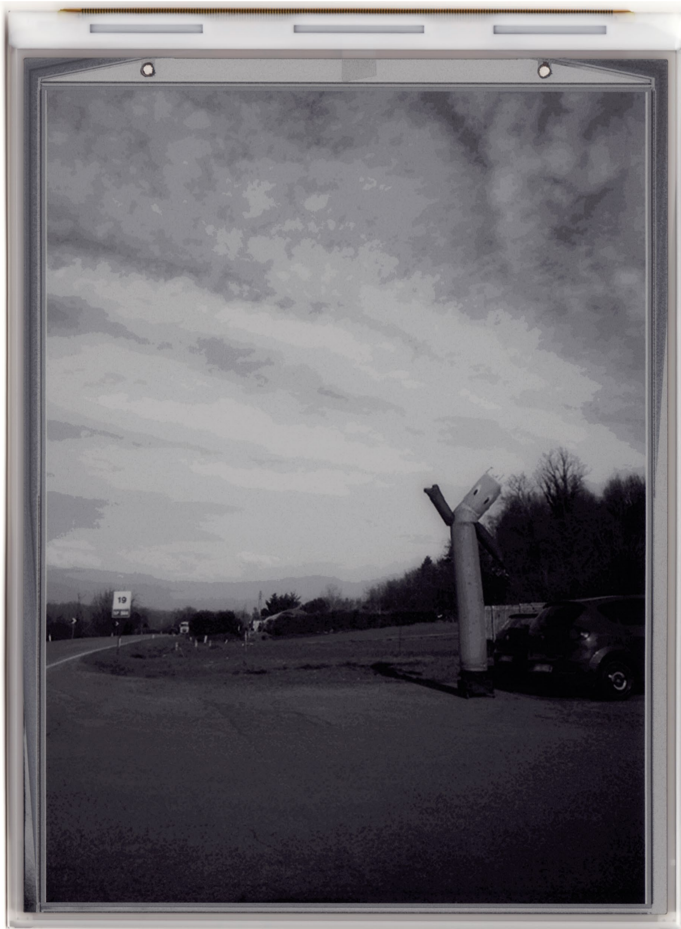
Urtype # 2 1

electronic ink on e-paper display - 102 mm x 139 mm - © urfaut - Edition of 6 plus 2AP - 2013