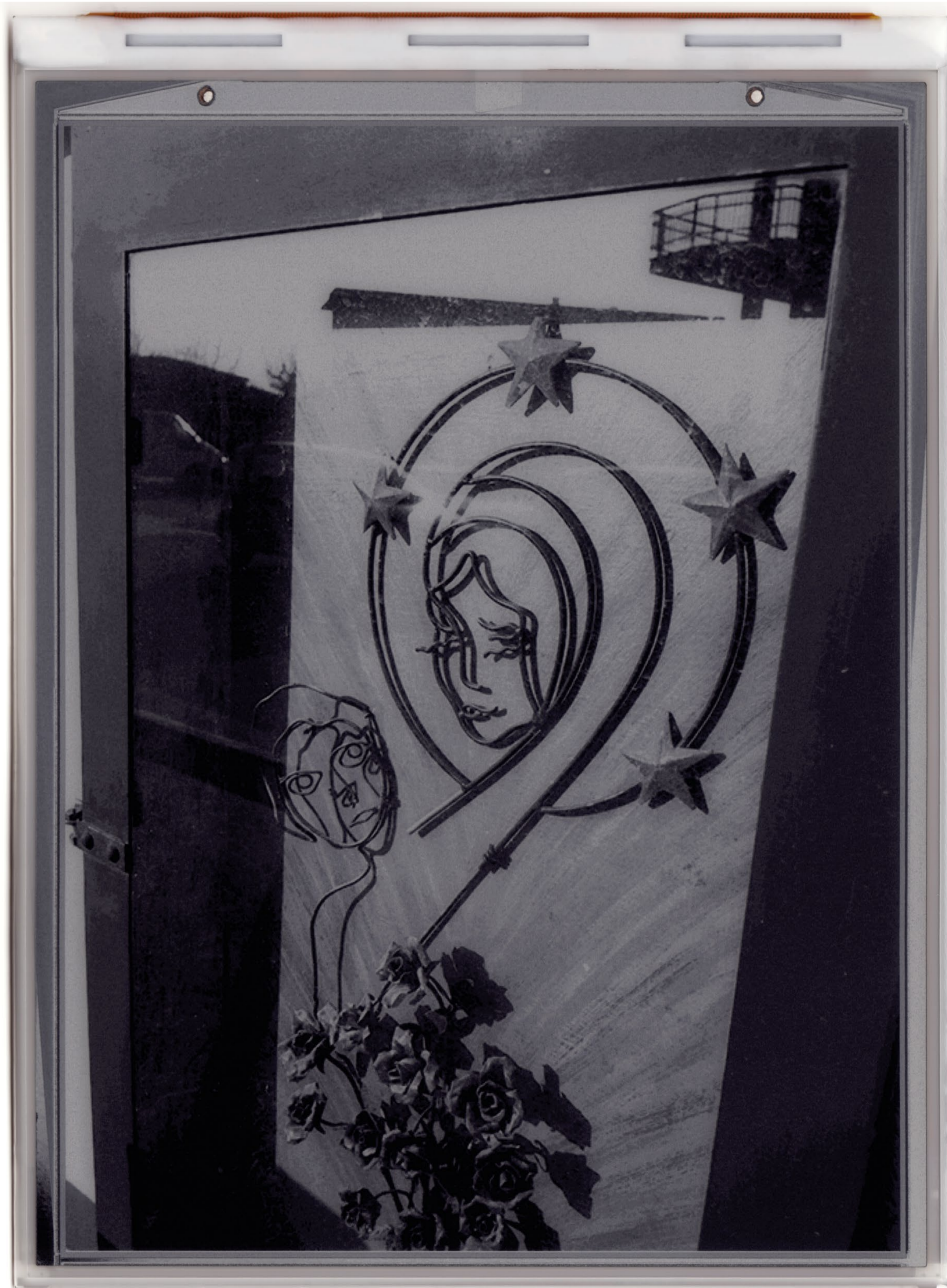
Urtype # 17

electronic ink on e-paper display - 102 mm x 139 mm - © urfaut - Edition of 6 plus 2AP - 2013