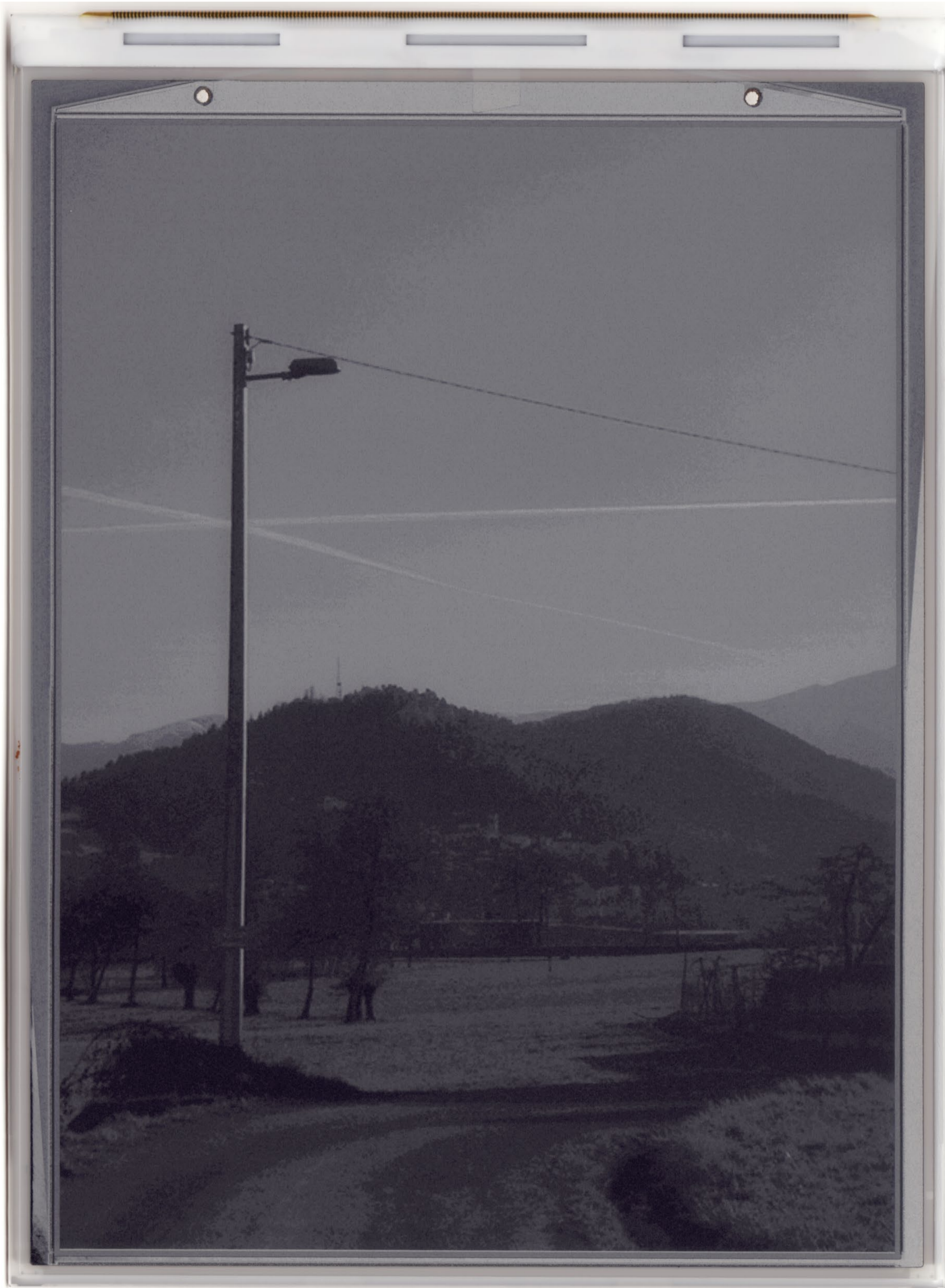
Urtype # 5

electronic ink on e-paper display - 102 mm x 139 mm - © urfaut - Edition of 6 plus 2AP - 2013