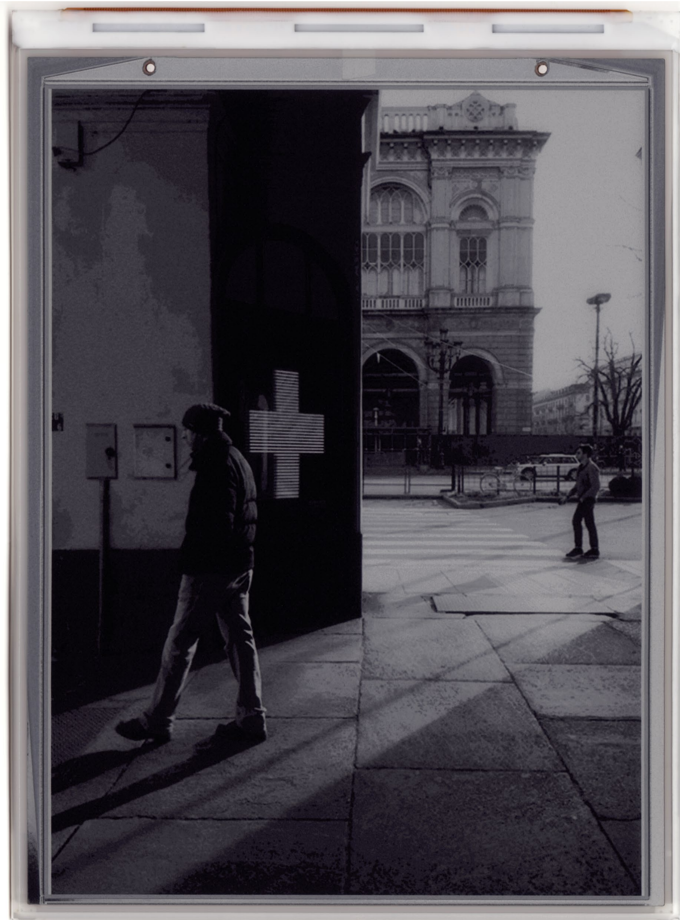
Urtype # 4

electronic ink on e-paper display - 102 mm x 139 mm - © urfaut - Edition of 6 plus 2AP - 2013