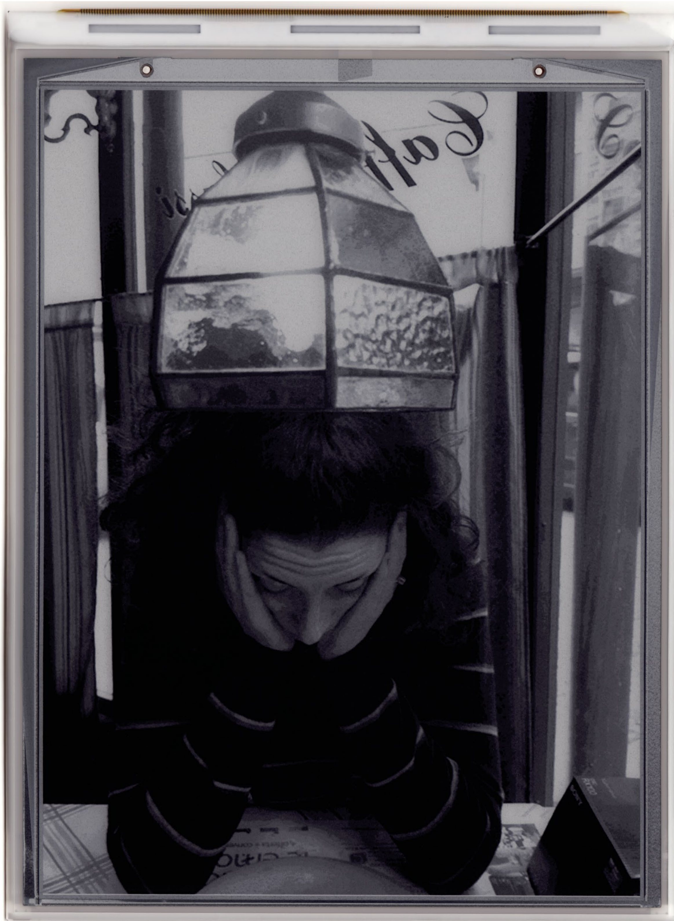
Urtype # 3

electronic ink on e-paper display - 102 mm x 139 mm - © urfaut - Edition of 6 plus 2AP - 2013