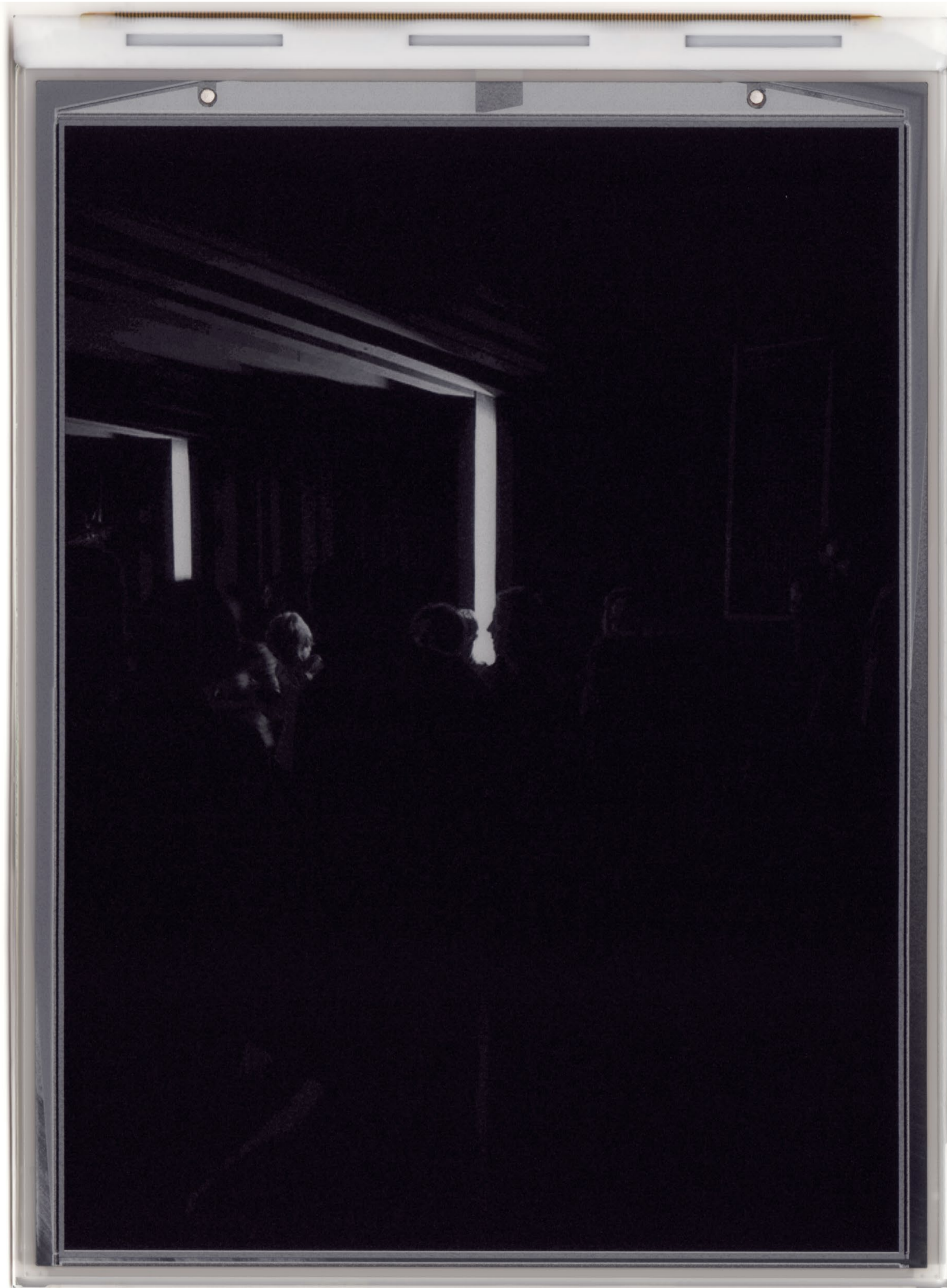
Urtype # 20

electronic ink on e-paper display - 102 mm x 139 mm - © urfaut - Edition of 6 plus 2AP - 2013