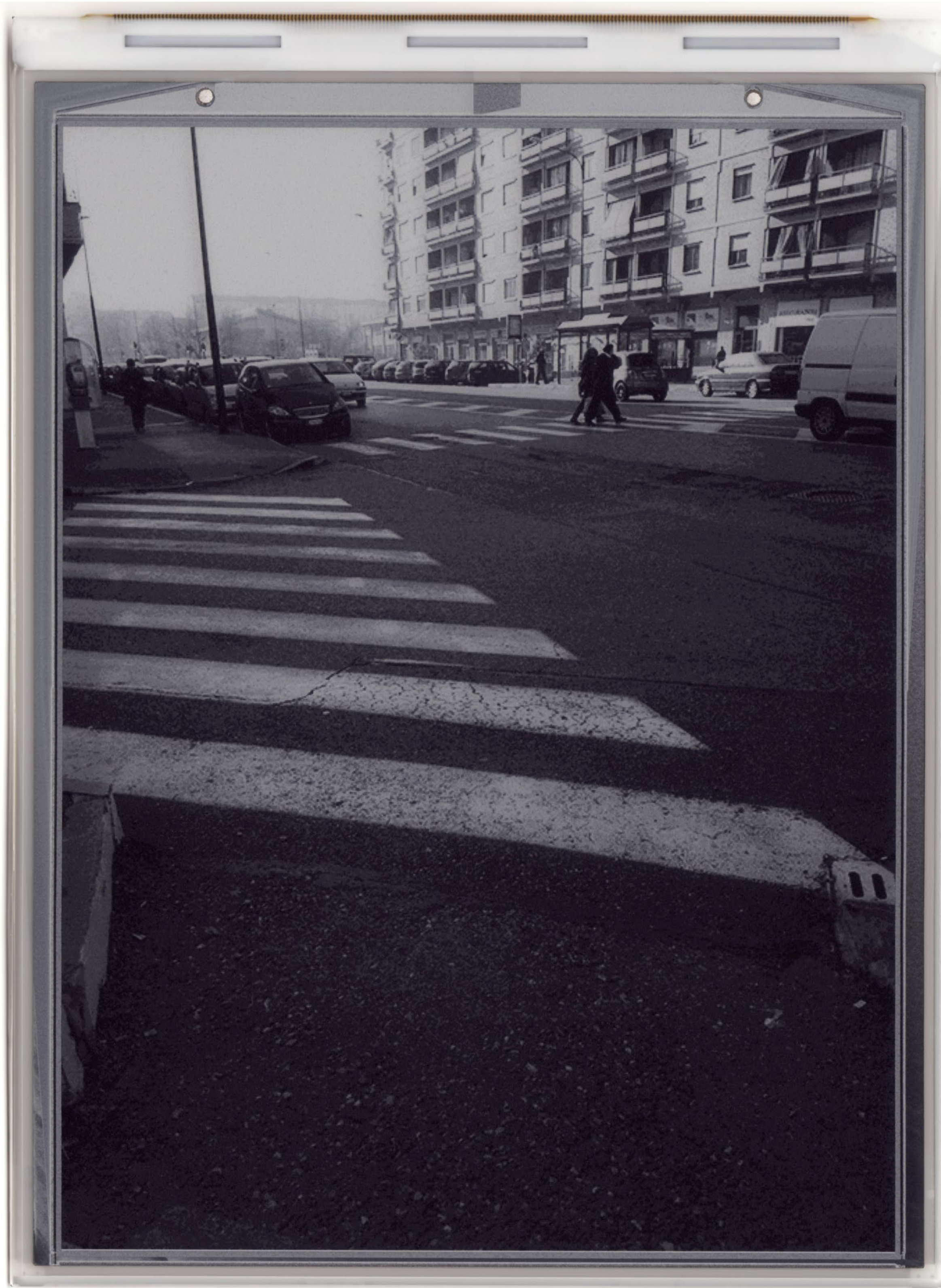
Urtype # 6

electronic ink on e-paper display - 102 mm x 139 mm - © urfaut - Edition of 6 plus 2AP - 2013