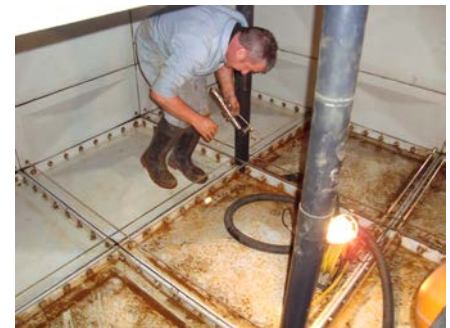
Replacing corroded galvanized bolts with steel bolts and re-torque to manufactures specifications