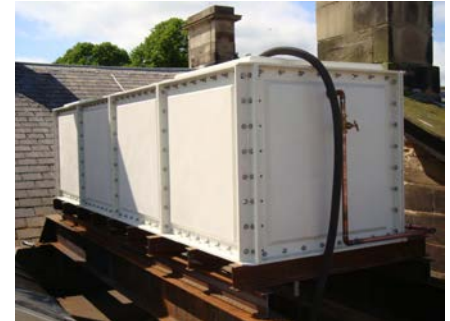
Installation of new GRP sectional tank