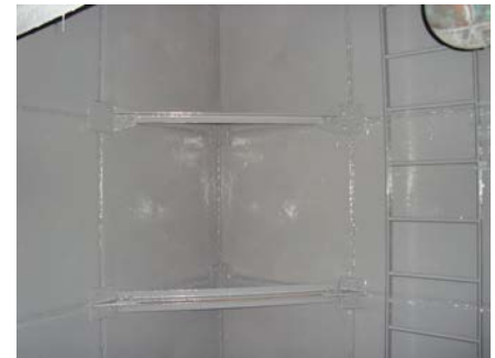
Newly painted water storage tank with newly installed internal ladders